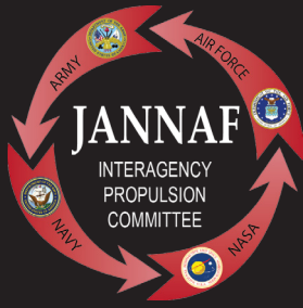
Exhibit and Sponsorship Details